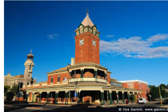
Broken Hill Post office.