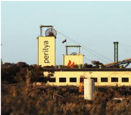
One of many mines Broken Hill Has.