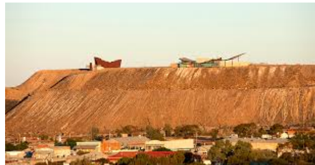
Line of Load