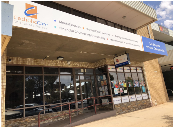
Broken Hill branch

Broken Hill is a small mining town with a population of 17,000 people.